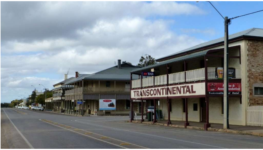
Quorn – beautiful SA architecture