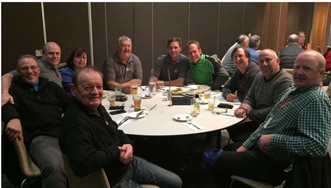
At the Renmark Club...