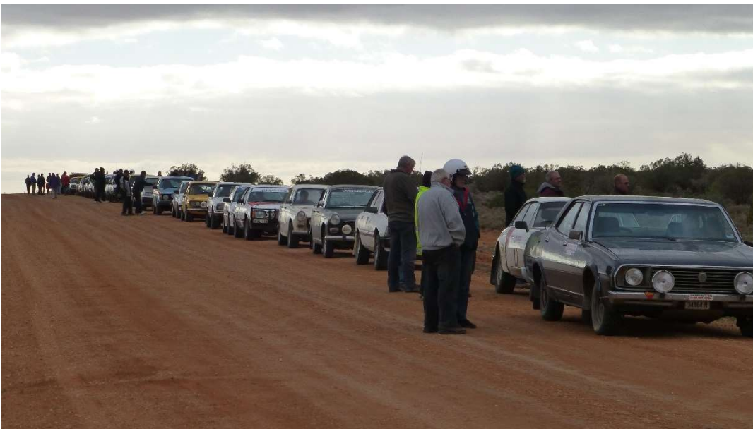
Cars lined up to do our stage at Coondappi