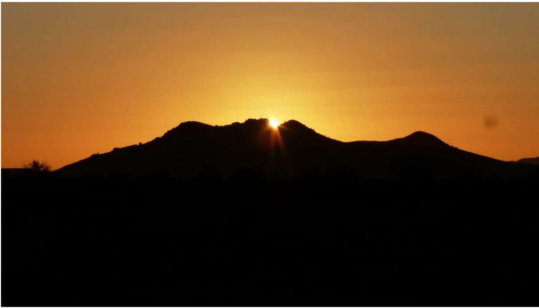
Sunrise in the Flinders Ranges