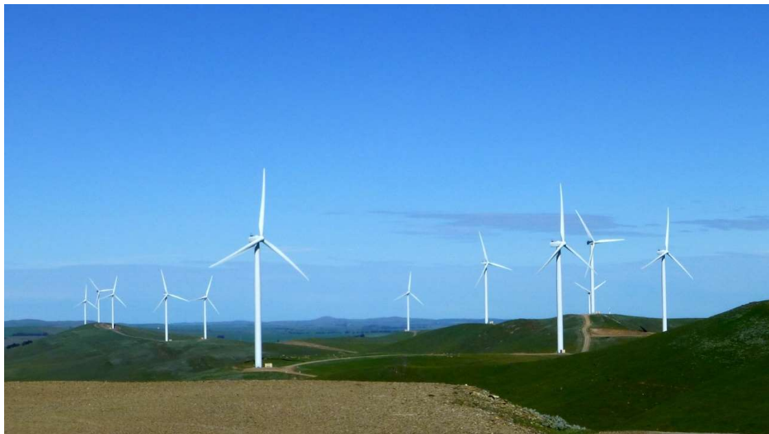
The ridgetop drive at Hallett. This was competitive in the Sydney to London. Scary...