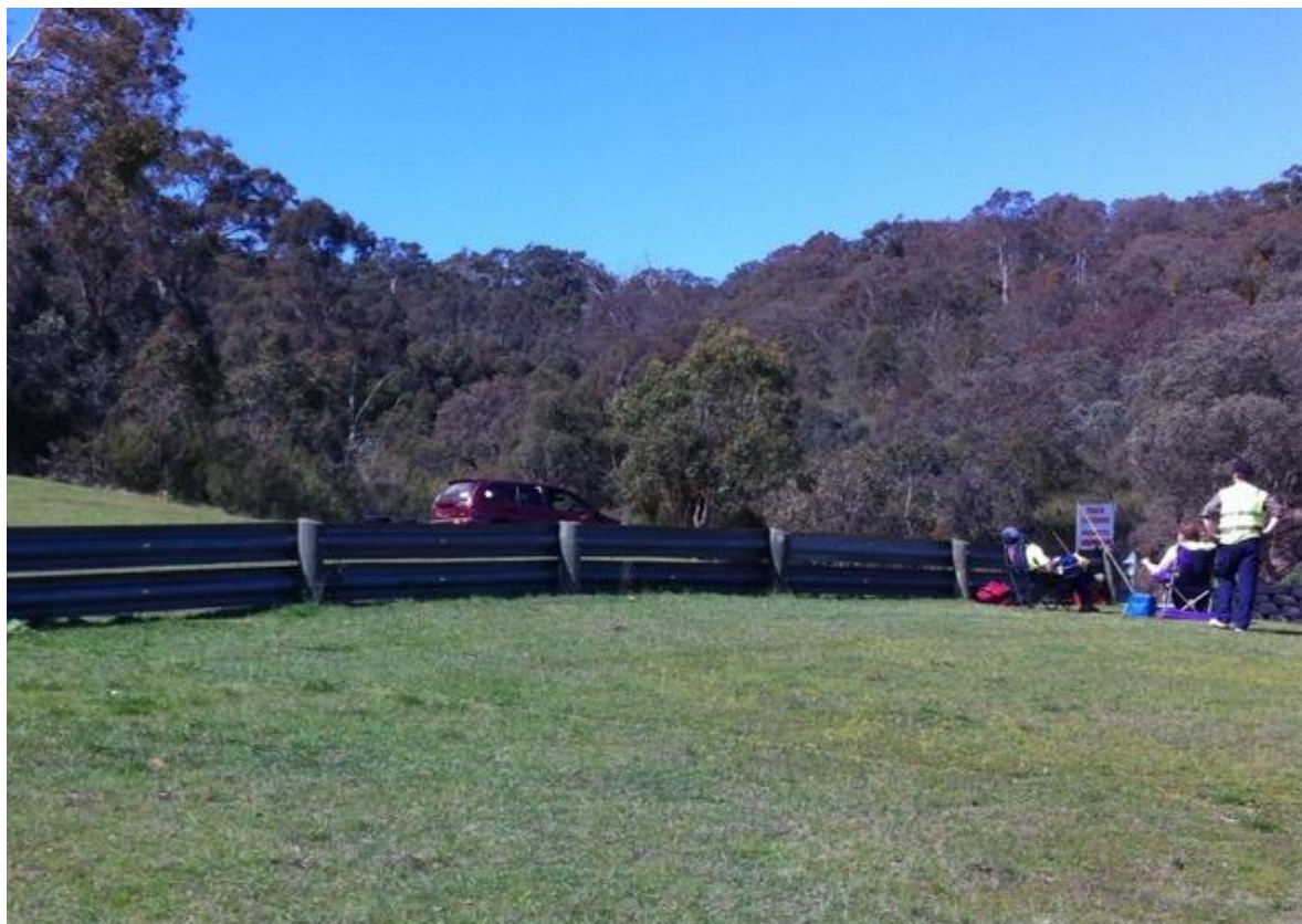
The only picture of Phil’s car as we were at opposite ends of the run line. (sorry Phil)