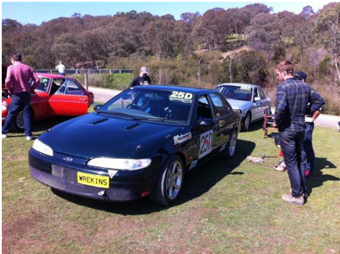
Car talk with the boys.