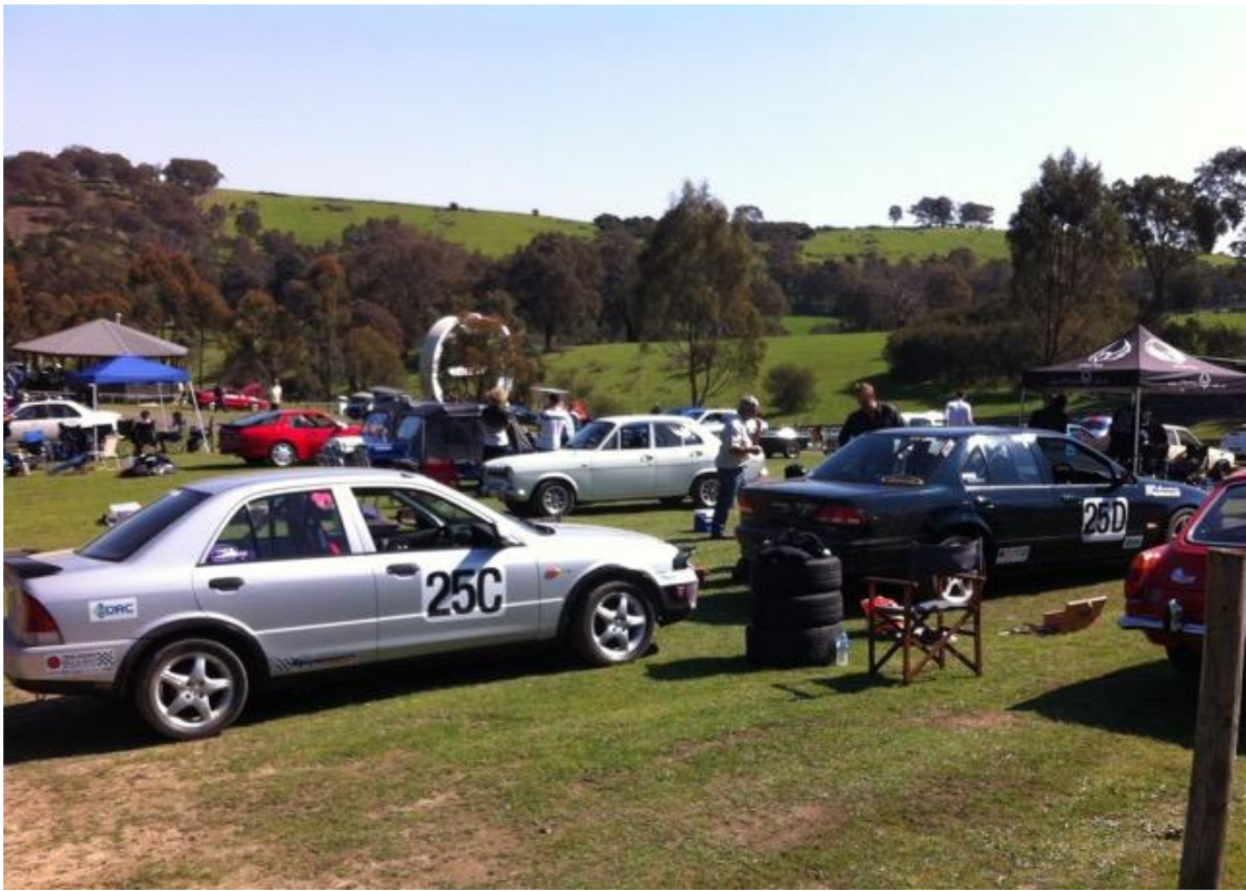
The super fast Laser waiting for a run in the pit area.