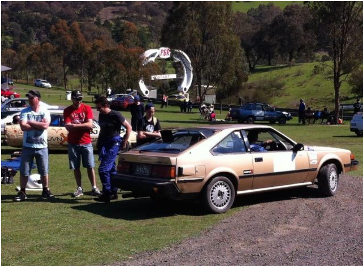
The Golden Gazelle has made a come back.